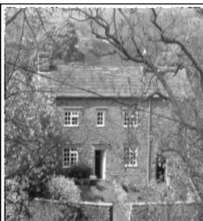
Blueberry Cottage - Grinton, Reeth Swaledale - North Yorkshire

Email : office@mbmcgarry.co.uk Regulated by the Solicitors Regulation Authority