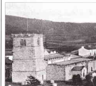
St. Andrew's Church Grinton.

Therefore we, as humans, must understand the custodial role God has entrusted to us. WE are meant to steward and care for these creatures on behalf of the Creator. Here in Grinton, we are celebrating and learning more about our resident bats and recognise their need for protection. Together with a range of publications, the bat displays are well worth seeing if you are in the Grinton area.